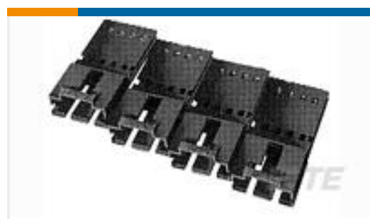
TE Part # 1-103653-6 17 MTE SHRD PIN HSG SR LATCH