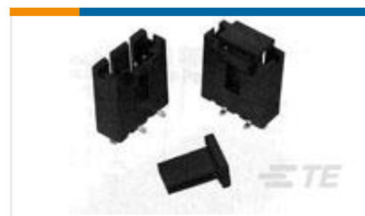
TE Part # 1825574-4 17 MTE VERT SMT HDR, w/o caps or bdlocks