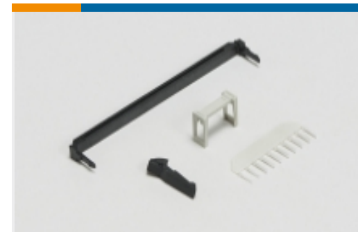
Ribbon Connector Accessories(1)