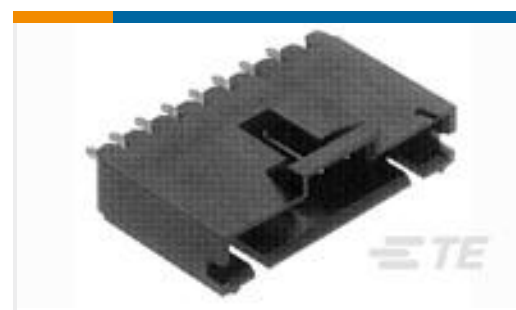
TE Part # 1977162-4 17 MTE HDR SRRA SMT.100CL w/o H-Downs