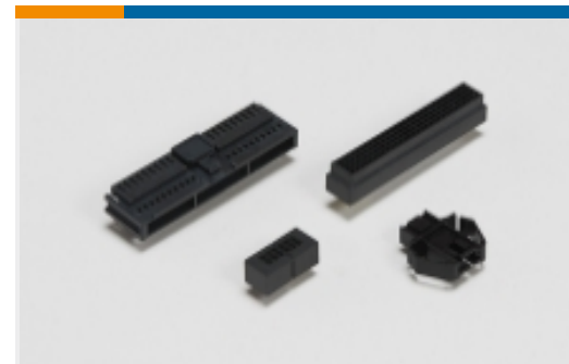
PCB Connector Shrouds(40)