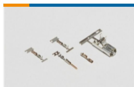
Wire-to-Board Connector Contacts(32)